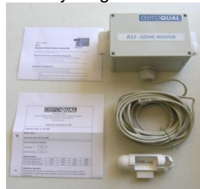
Image shows all the items included with the R-13 Kit. Manual (upper left), R-13 Enclosure (upper right), 33-ft of cable (middle right), Cable receptacle (lower right), & Calibration certificate (lower left).