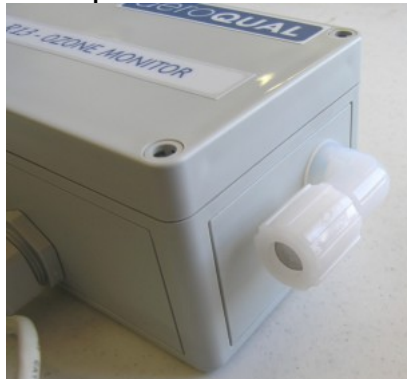
Image shows a close view of the angled Teflon inlets. Teflon is used since it will not react with the ozone thereby ensuring consistent levels as it passes through the unit. SS screen ensure particulates will not enter the unit.