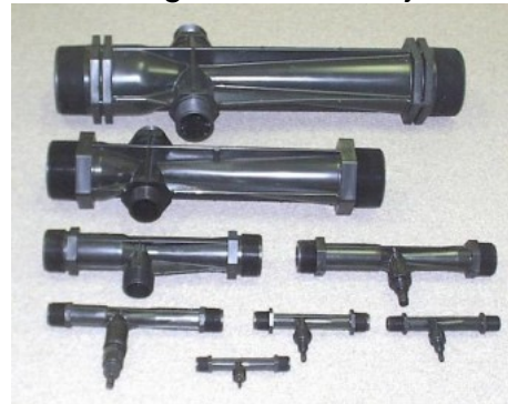
Image shows the various sizes of ozone injectors & ozone venturis. Injectors range from 1/2-in MPT to 4-in MPT process connections. All ozone injectors made from high quality black Kynar (PVDF).