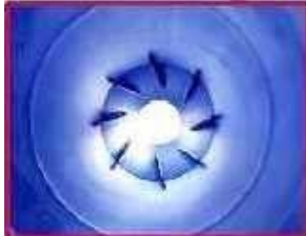
Ozone Injectors have internal mixing vanes to improve mass transfer efficiency, suction capacity & mixing capabilities.