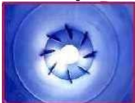
Extra Image Description