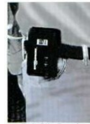
Belt Clip Pouch

Easily clip the A-21ZX onto your belt for instant ozone sensing.